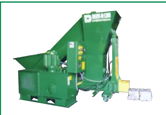
Dac 800 with Optional Conveyor

DAC 800 DIRECT CHARGE DENSIFIER FOR STEEL & ALUMINUM CANS